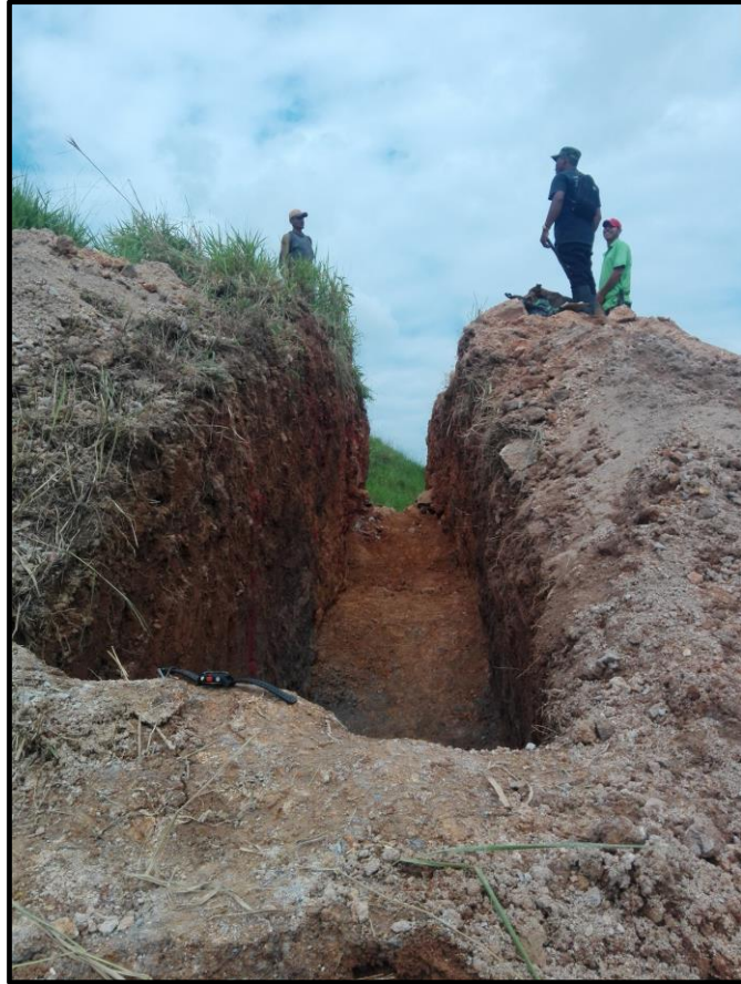
Figure 2 Typical Trench: Sampling of MTTR17050 (Toronto Vein)