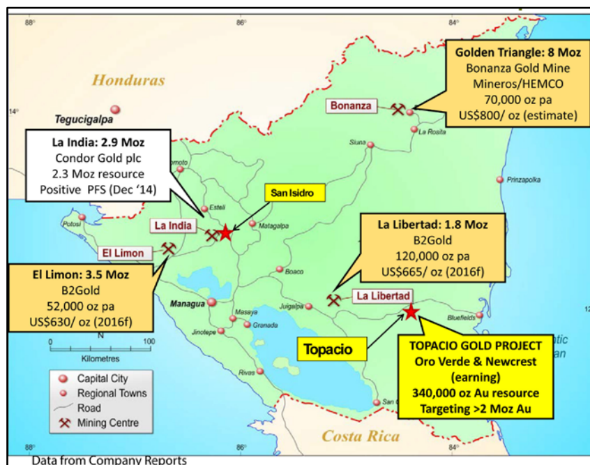
Figure 3 Major Nicaraguan gold deposits and the Topacio Gold Project

National Instrument 43-101 (“NI 43-101”) is a national instrument for the Standards of Disclosure for Mineral Projects within Canada and as such this estimate is a foreign estimate and is not reported in accordance with the JORC code (Australia). A competent person has not done sufficient work to classify the foreign estimate as mineral resources in accordance with the JORC code and it is uncertain that following evaluation and/or further exploration work that the foreign estimate will be able to be reported as mineral resources in accordance with the JORC code.