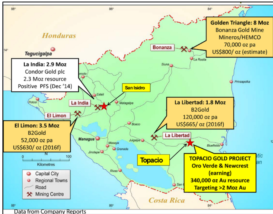
Figure 1 Major Nicaraguan gold deposits and the Topacio Gold Project