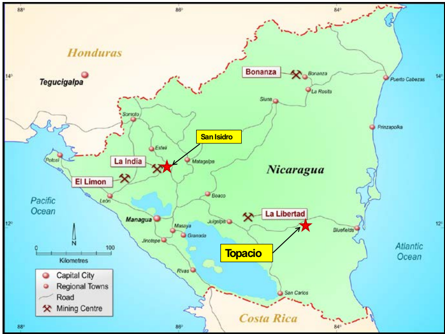
Figure 1 Major Nicaraguan gold deposits and the Topacio Gold Project