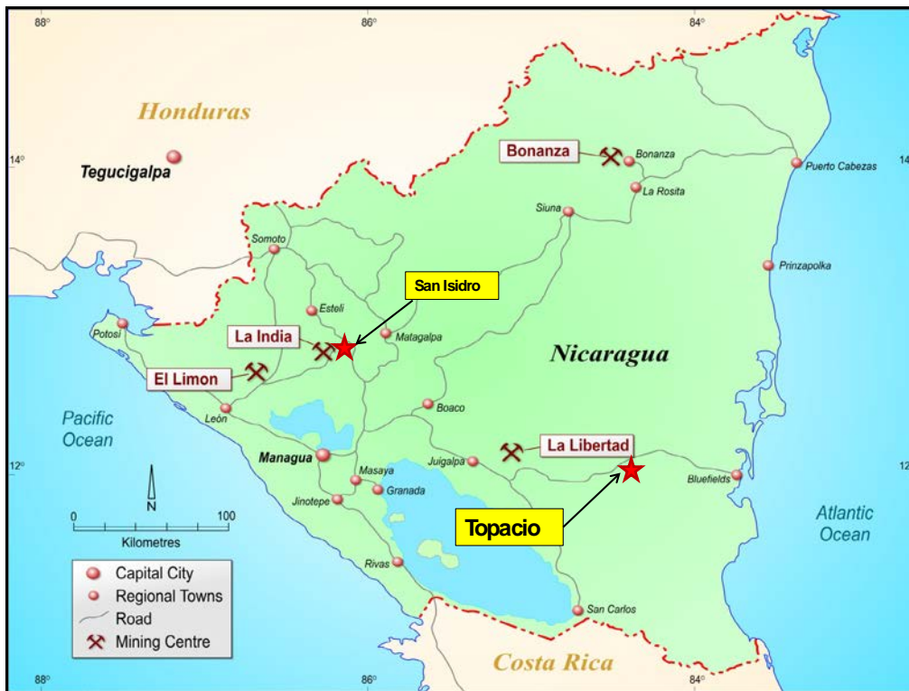
Figure 1 Major Nicaraguan gold deposits and the Topacio Gold Project