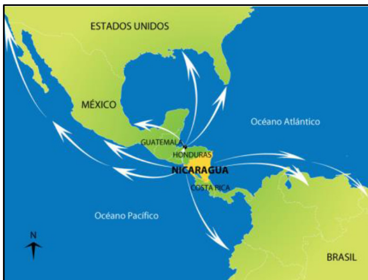
Nicaragua – the Centre of the Americas...

About Oro Verde Limited: Oro Verde Ltd is a mineral exploration company focused on identifying and developing significant gold projects in Central America, particularly Nicaragua. Oro Verde is currently undertaking due diligence to finalise an Option to Purchase Agreement on the Topacio Gold Project in Nicaragua that currently contains a NI43-101 compliant Inferred Mineral Resource of 340,000 ounces of gold. Oro Verde also holds 100% of the early stage San Isidro Gold Project located adjacent to the 2.4 million ounce La India gold project.