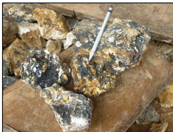
Figure 5 TR008 – Mn-rich breccia with quartz veining