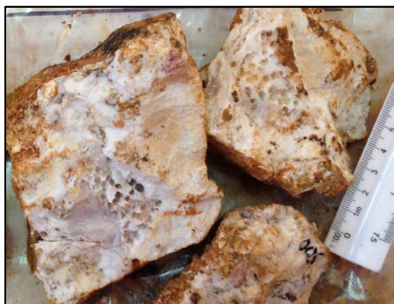
Figure 4 TR005 – Epithermal quartz veining