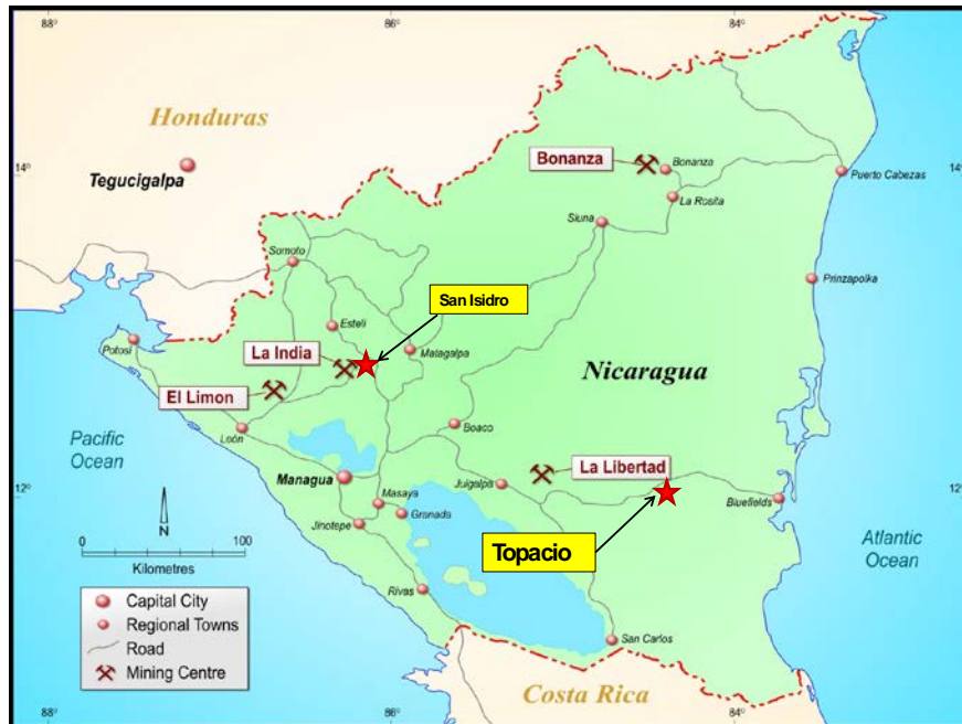
Figure 1 Major Nicaraguan gold deposits and the location of the Topacio Gold Project

While the initial sampling exercise is part of the Company’s due diligence exercise and was not planned to be systematic, nor comprehensive, the high grade gold results provide strong support for the potential of the project, not only in the area of the existing resource but also in under-explored portions of this large mineralised epithermal system (Figure 2).