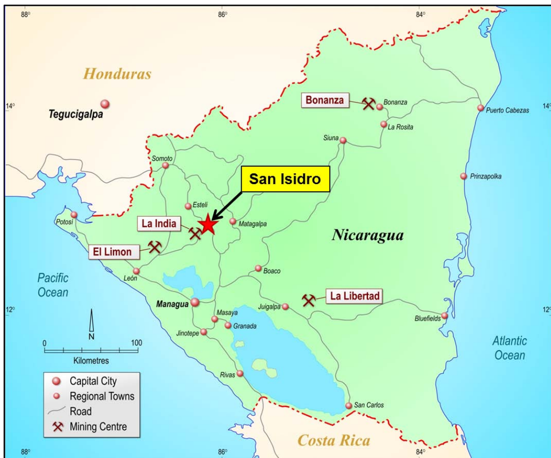
Figure 1: Nicaragua and the location of the San Isidro project

The La India Gold Mining District hosts the historical La India Gold Mine which processed an estimated 1.7Mt at 13.4g/t Au, producing 576,000oz gold between 1938 and 1956. In addition to this historical gold production, the La India Gold Project, held by AIM-listed Condor Gold Plc, currently hosts several deposits.